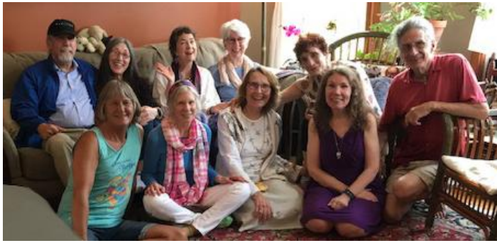
Fairfield Feast of Sittings, May 2019